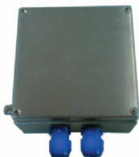
Stainless Steel 1.4301 (V2A) 1.4404 (V4A)