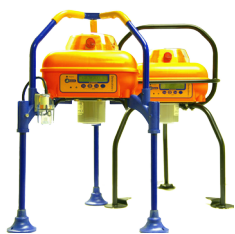
Detective+ and Detective Net Transportable wireless area gas monitor