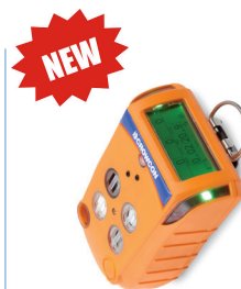
Gas-Pro IR Infrared 5-gas monitor