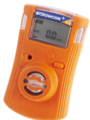
Crowcon Clip Personal maintenance free single gas monitor

Crowcon also manufactures a wide range of portable gas detection products: