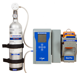
I-Test Bump and calibration station