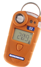
Gasman Single gas personal monitor

Crowcon reserves the right to change the design or specification of the product without notice. Check www.crowcon.com for updates.