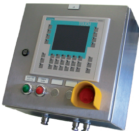
Zone 2/22 Operator Panel