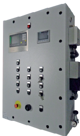
Ex pz Control cabinet