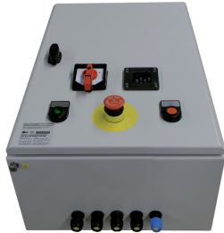
Sheet Steel control panel for Zone 22